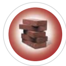
Real Property Consulting