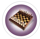
Personal Property Consulting

Comprehensive. Credible. Fresh. It's the way we do business.